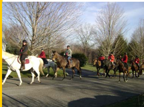
CAROLING ON HORSEBACK December 18th, Hitting the road in search of people to sing to! Almost everyone festive in holiday colors.