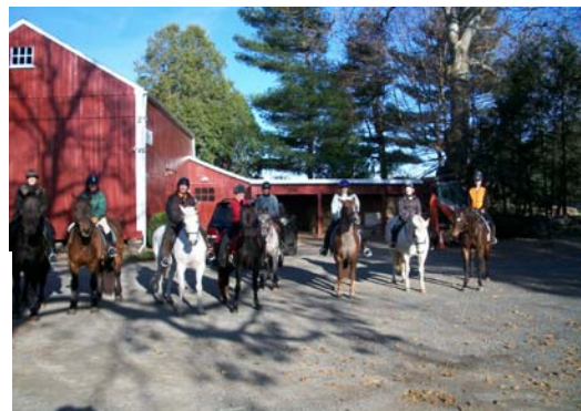
TURKEY TROT, November 20th Great turnout for a pick up ride around the trail network on lower Greenfield Hill.